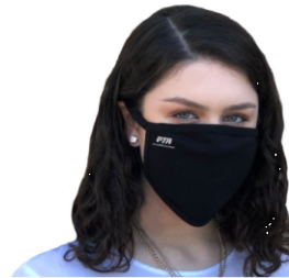
Premium Face Mask