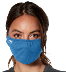
Shaped Face Mask